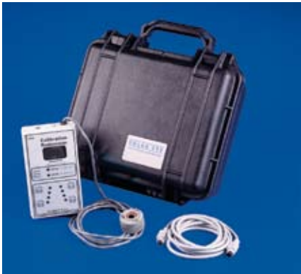
Calibrations with the CR10 Radiometer take only minutes and comply with ISO 9000 requirements.

In addition to its other advantages, the patented Solar Eye system allows for easy calibration and traceability for ISO compliance.